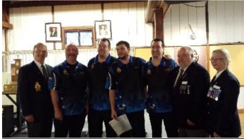
Zone B 7 Dart Winners Branch 609